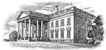
THE WHITE HOUSE HISTORICAL ASSOCIATION