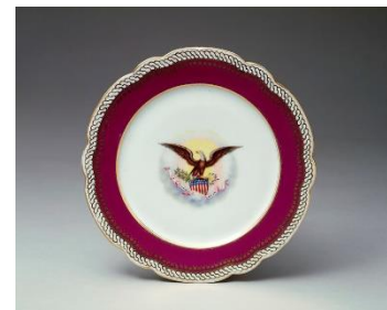
Inspired by Lincoln White House china design