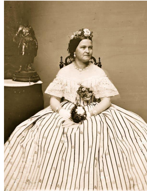
Mary Todd Lincoln (1863)

Now, imagine you are Elizabeth Keckley and Mrs. Lincoln asked for a new dress. What would you design for the first lady?