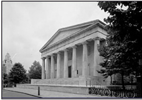
The Second Bank of the United States.