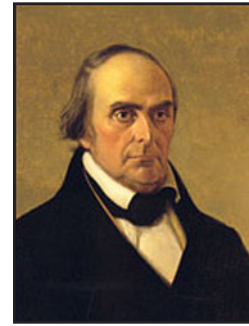
Daniel Webster.

Thomas Jefferson and members of his Democratic-Republican party opposed the Bank for numerous reasons, including a suspicion that it was unconstitutional. The Democratic-Republicans were strict constructionists, arguing that the federal government only had the powers specifically granted to it in the Constitution. Since the Constitution did not specifically state that Congress can charter a bank, the Democratic-Republicans considered the Bank unconstitutional. In 1811, when the Bank's charter was about to expire, the Democratic-Republicans controlled both Congress and the presidency. They decided to allow the Bank's charter to lapse, and the Bank went out of business.