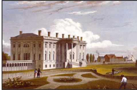
Southwest view, c. 1835

The White House about 1835. You can see one of the wings added to the side of the house. Wings on both sides were built because the president needed rooms for storing food and other items. Servants worked in the wings, too.