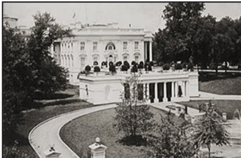
East entrance, 1902.

Theodore Roosevelt built a new entrance to the White House in 1902. Visitors coming to a party would drive their carriages up this driveway to the East Wing. They would walk through the doors and through a hall to get to the middle part of the White House.