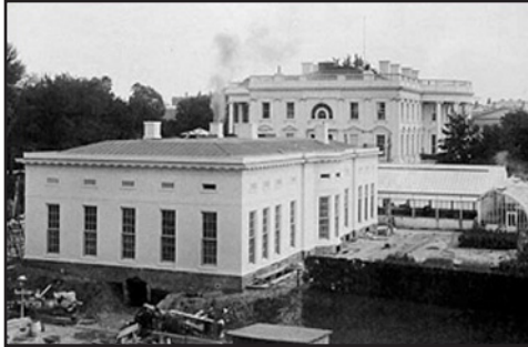
West wing, 1902.

President Theodore Roosevelt tore down the greenhouses in 1902 and built offices on the west side of the White House.