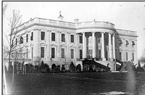
South front, 1846.

This is the first photograph of the White House. It was taken about 1846.