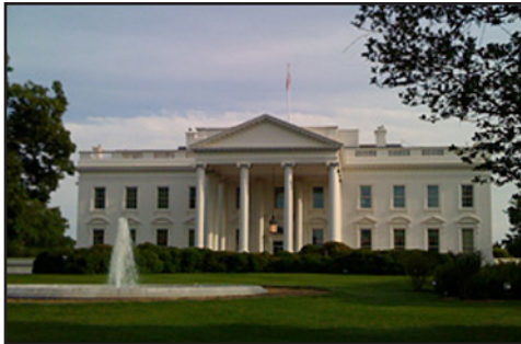
The White House Today.

The stone walls have stood since President John Adams first occupied the house in 1800. There are wings on both sides of the White House but trees and bushes help to hide them. This is the famous White House that is known by people all over the world.