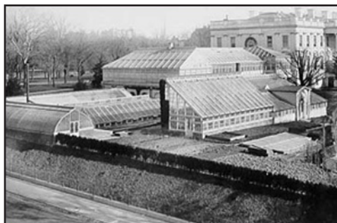
Greenhouses at the White House, c. 1890.

Big glass buildings were built on one side of the White House. Plants grew in these greenhouses.