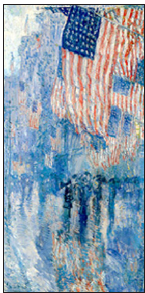
“Avenue in the Rain.” Childe Hassam, 1918

Today, you can see pictures of the White House on television, in newspapers, and in magazines. Here you will see pictures of the White House from long ago and from today. You will see how the middle part of the house has not changed much since John Adams was the first president to live there. But you will see the White House grow when more people live and work there. The house grew out, up, and down, but the middle part has stayed the same. This is important. If a symbol is going to make you think of an idea, like leadership, the symbol must not change.