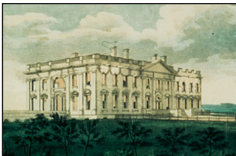
Print of the White House after the 1814 fire by George Munger.

The White House was burned in 1814. British soldiers came to Washington and set fire to it. You can see the burn marks near the windows.