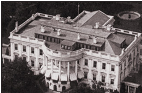
Roof after expansion, 1927.

President Calvin Coolidge decided more space was needed for the president's family. New rooms were built on top of the White House in 1927.