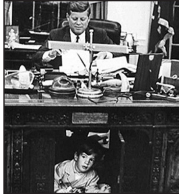
John Jr. plays under his dad's desk.