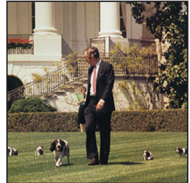
Millie and her puppies.