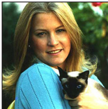
Susan Ford and her cat Shan.