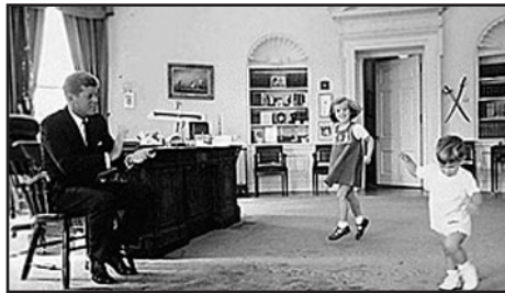
Caroline and John play in the Oval Office.

When President and Mrs. John F. Kennedy moved into the White House in 1961, they had two small children. Caroline was almost four years old and John, Jr. was a baby. They were the youngest children to live in the White House since Quentin Roosevelt.