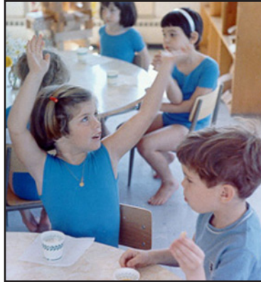
Caroline Kennedy in the White House classroom.