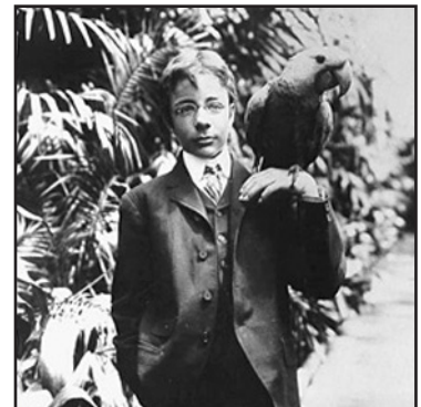
Theodore Roosevelt, Jr. and his macaw.