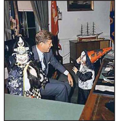
John F. Kennedy Library