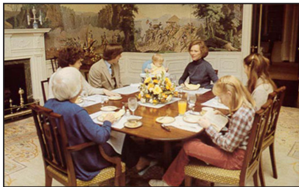
Amy reads a book during dinner with her family.

Amy Carter was in third grade when she came to live in the White House. She went to a school in Washington, D.C. She had two older brothers who lived in the White House with their wives. Amy missed her home. She lived in Georgia before her father, Jimmy Carter, was president. But Amy met many important people who came to the White House from around the world. She also had a tree house built for her. There are many trees in the backyard of the White House. Amy could go to her tree house when she wanted to be alone.