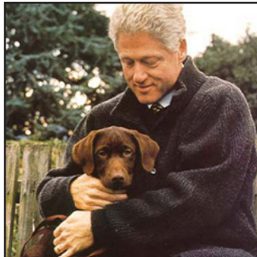
President Clinton and Buddy.