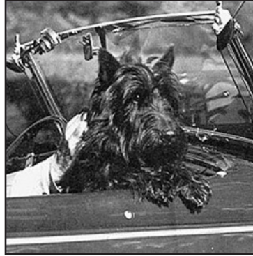
Fala.