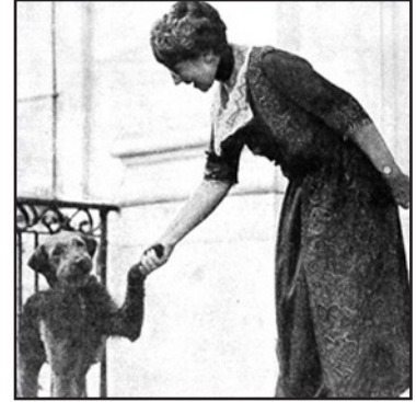
Florence Harding and Laddy Boy.