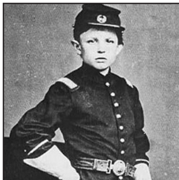
Thomas (Tad) Lincoln.

Tad lived in the White House during the Civil War. He liked to play war games. He had an army uniform made to fit him. Soldiers protected the White House during the Civil War. Tad liked to talk to them and ask them what it was like to fight in a war.