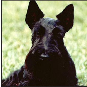
The Bush's dog Barney.

Tad Lincoln, Quentin Roosevelt, the Kennedy kids, and Amy Carter all had pets at the White House. Many first kids and their parents have owned pets. Pets made the White House seem like a home. Let's meet some of them.