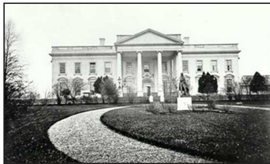
The White House as Lincoln knew it.