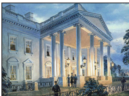
Abraham Lincoln talks to an officer at dusk in 1863. Painting by Tom Freeman, 1998

While admitting it was "possibly illegal," he defended his call-up of troops for a three-month period, saying it was ventured upon because of "what appeared to be a popular demand and a public necessity." Further, he had his reasons for suspending the writ of habeas corpus, pointing out that the laws of the nation were being resisted "in nearly one-third of the States." He addressed the question of who should be allowed to suspend the writ and noted that the "Constitution itself is silent as to which or who is to exercise the power"—Congress or the chief executive. But, he asserted, the Constitution was clear when it stated that it could be suspended in a "dangerous emergency," and this rebellion qualified as just such an emergency. 26