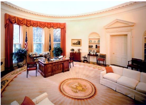
Photograph of the Oval Office during the Ronald Reagan administration (ca. 1983).

Share your finished designs with us at @WhiteHouseHstry or via email at education@whha.org