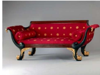
Grecian Sofa, ca. 1810-1825.