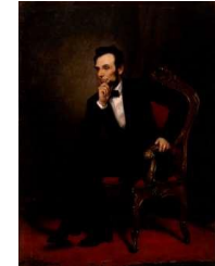
Official portrait of Abraham Lincoln, painted by George Peter Alexander Healy in 1869