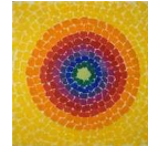
Resurrection, Alma Thomas, 1966