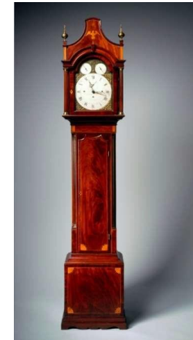
Tall Case Clock, Federal Style, ca. 1800.