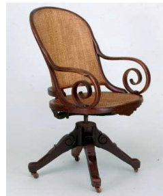
Swivel Chair, ca. 1866