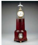
Lighthouse Clock with a portrait of the Marquis de Lafayette, ca. 1825