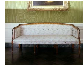
Mahogany Sofa, unknown date