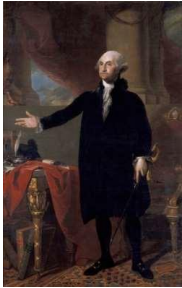
Official portrait of George Washington, painted by Gilbert Stuart in 1797