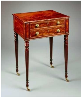
Mahogany Work Table, 1814