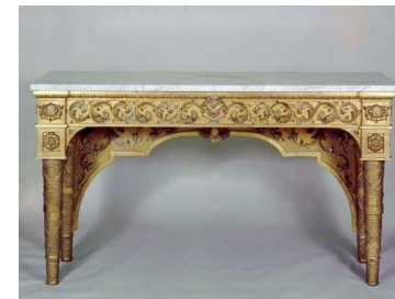
Gilded Pier Table, ca. 1818