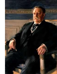
Official portrait of William H. Taft, painted by Anders Leonard Zorn in 1911