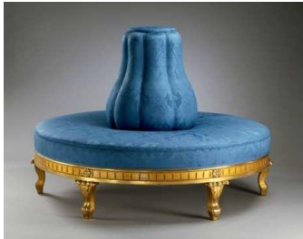
Rococo Revival Center Divan, 1859