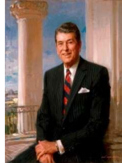
Official portrait of Ronald Reagan, painted by Everett Raymond Kinstler in 1991