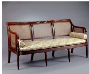
Scrolled-back Settee Sofa, ca. 1810