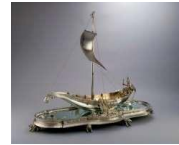
Hiawatha's Boat (Centerpiece), made by Gorham Manufacturing Company, 1871