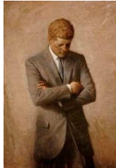
Official portrait of John F. Kennedy, painted by Aaron Shikler in 1970