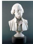
Porcelain Bust of Thomas Jefferson, 1908