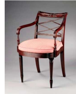
Mahogany and Tulip Poplar Armchair, ca. 1810-1820