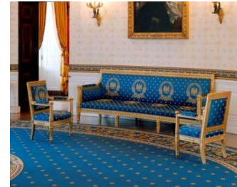
Sofa and armchairs, made by Pierre-Antoine Bellange, ca. 1817