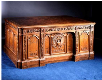
Resolute Desk, 1880