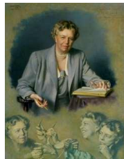
Official portrait of First Lady Eleanor Roosevelt, painted by Douglas Chandor in 1949