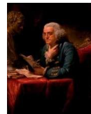
Portrait of Benjamin Franklin, painted by David Martin in 1767