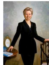
Official portrait of First Lady Hillary Clinton, painted by Simmie Knox, 2003