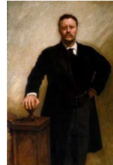
Official portrait of Theodore Roosevelt, painted by John Singer Sargent in 1903