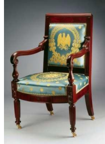
Mahogany armchair, ca. 1817-1825