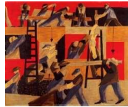
The Builders, Jacob Lawrence, 1947