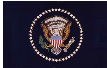
The Flag of the President, 1945