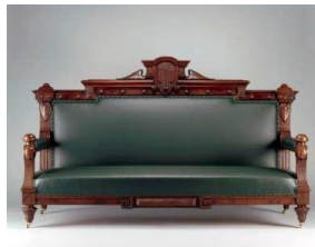
Sofa, made by Pottier Stymus Manufacturing Company, 1869