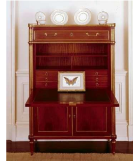
Replica of desk on which James Monroe signed the Monroe Doctrine in 1823