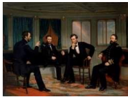
The Peacemakers, George Alexander Healy, 1868