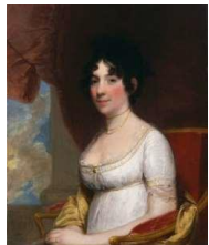
Official portrait of First Lady Dolley Madison, painted by Gilbert Stuart in 1804