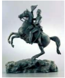
Statuette of Andrew Jackson, 1855