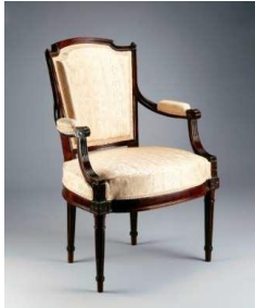
George Washington Armchair, ca. 1793-1797