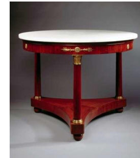
Mahogany Center Table, ca. 1817