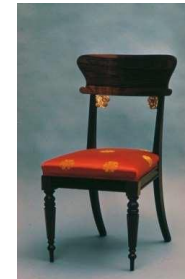
American Empire Side Chair, unknown date