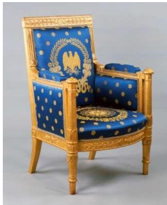
Gilded Armchair, made by Pierre- Antoine Bellange, ca. 1817