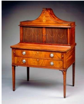
Tambour Desk, ca. 1795-1810