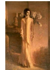
Official portrait of First Lady Jacqueline Kennedy, painted by Aaron Shikler in 1970