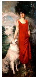
Official portrait of First Lady Grace Coolidge, painted by Howard Chandler Christy in 1924