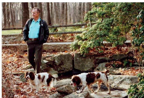
President George H.W. Bush walks his dogs at Camp David.

While at Camp David, the president may hike, swim, ride horses, practice golf and shooting sports, or simply enjoy some quiet time. Many presidents have used Camp David as a place to have more relaxed meetings with members of Congress, Cabinet advisors, and even leaders of other countries. Technology like telephones and the internet allow the president to work—even in the woods!