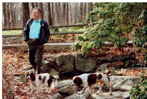
President George H.W. Bush walks his dogs at Camp David.

Technology like telephones and the internet allow the president to work—even in the woods!